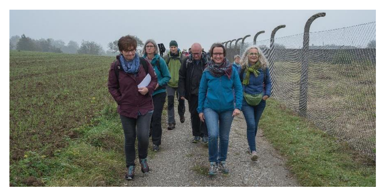
Commemorative march to concentration camp Mauthausen.

We highlight and contribute to society's remembrance of the National Socialist period, for example much was done in connection with the 75th anniversary of the end of the Second World War.