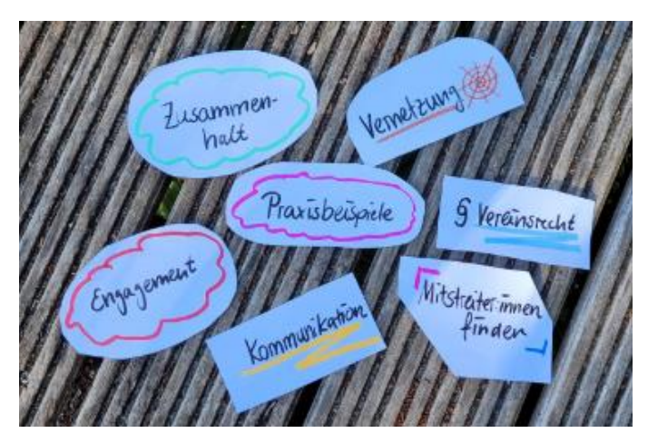
Collection of different topics related to active citizenship.

We offer ourselves as moderators in communities where conflicts have arisen.