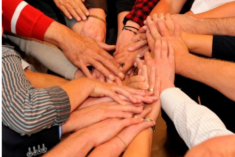
"Ehrenamt" / Volunteering is a fundamental topic of Katholische Landvolkhochschule Oesede Oesede.