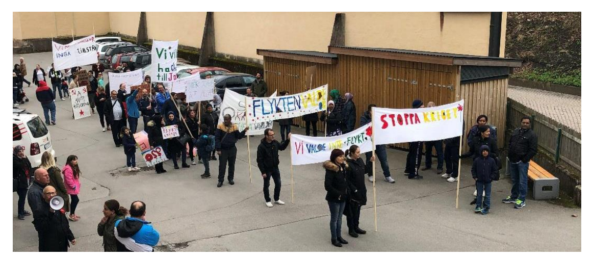
Demonstration organized by students and teachers at the school.

balance between on-site and distance learning towards more distance learning especially for those studying at secondary school level on the Second chance course.