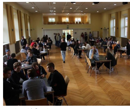
Meeting with first time voters.

We work to support young first-time voters who get the chance to talk to politicians before they vote.