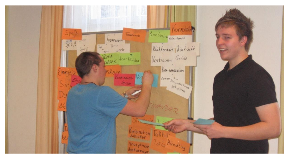
Participants collecting skills which they need to be active citizens.