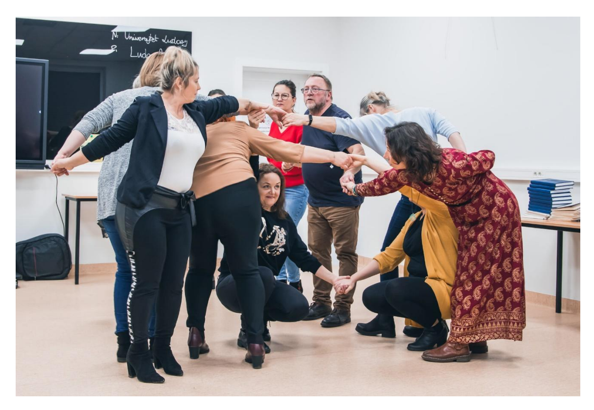
Participants at the school.

The boys at the treatment center are offered various forms of volunteer work in the community.