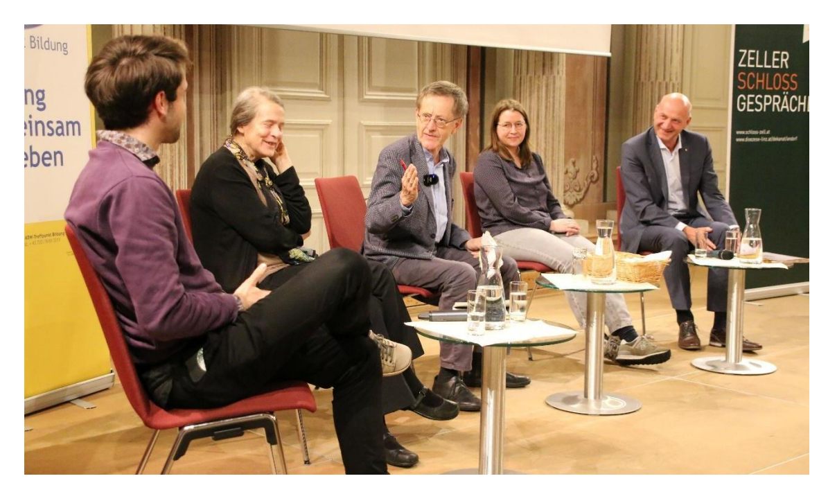
A panel discussion at the Zeller Castle Talks 2022.