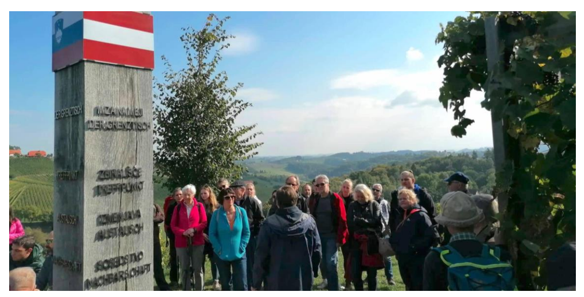
People learning about the border region between Austria and Slovenia.