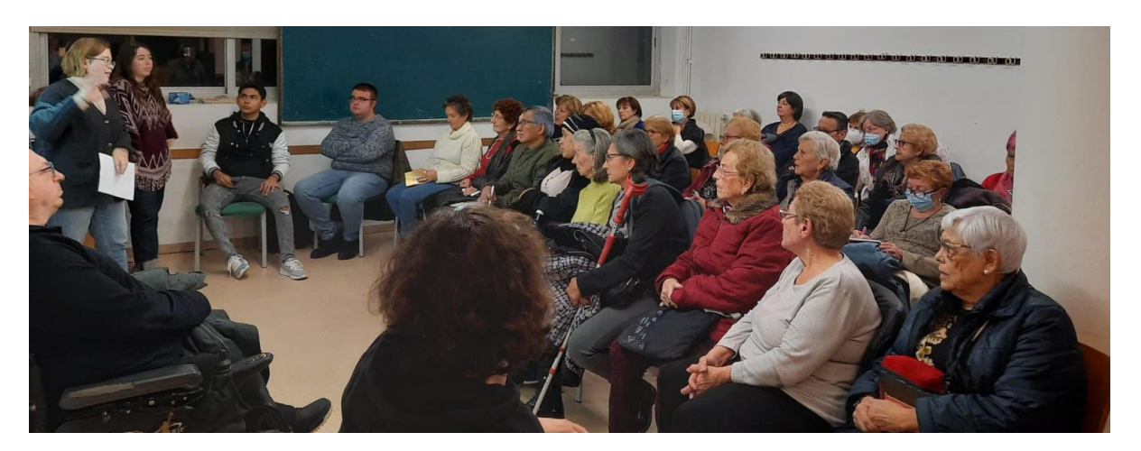
Meeting at the school.

There is a diversity of activities to meet the needs of the district's residents. The school gives courses in initial literacy; languages as Spanish, Catalan, English, French and German; training in ICT, from digital literacy to 3D design and mobile applications; workshops on physical movement, as sevillanas, dance and fitness training; aesthetic courses in ceramics, painting, ballet, etc. The school also helps students to prepare for free access to degrees, so that people can continue their studies. So called dialogic gatherings play an important role. Dialogic gatherings can be literary (in Spanish, Catalan, and English), artistic, musical, feminist, mathematical, scientific, etc.