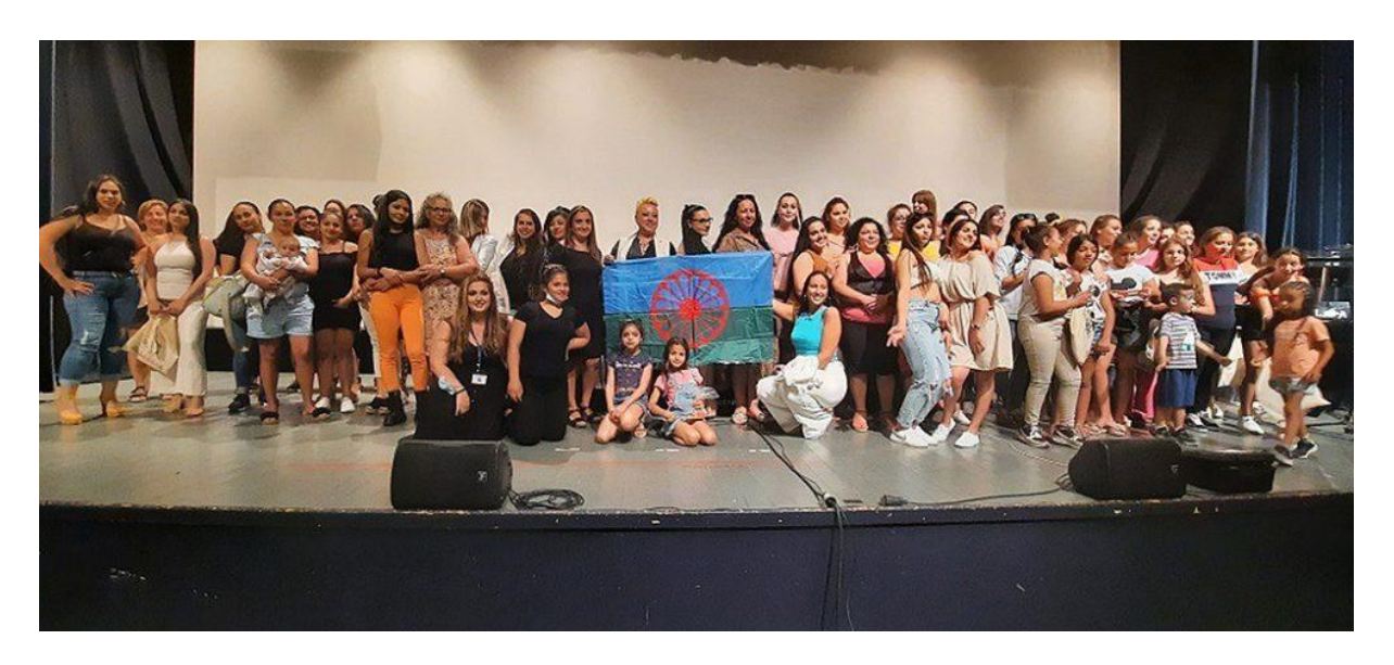
The Roma Women Students Gatherings of Catalonia are one of the most prominent activities carried out by Drom Kotar Mestipen.

I give you an example; because of these discussions, we offer the course of pedagogues of free time. Through this course, there is a positive impact both on the woman who has obtained the title and who is working on it, as well as in her environment and in the school. In the first place, for the women who take the course, because in many occasions they do not believe that they can obtain a degree as they are women with low academic levels. Then there is a transformation in them when they get the degree and work in the schools. Secondly, many of the women are mothers, and they become references for their children and environment. Thirdly, having Roma professionals working in the schools makes it a more inclusive and diverse school, as well as combating stereotypes and prejudices.