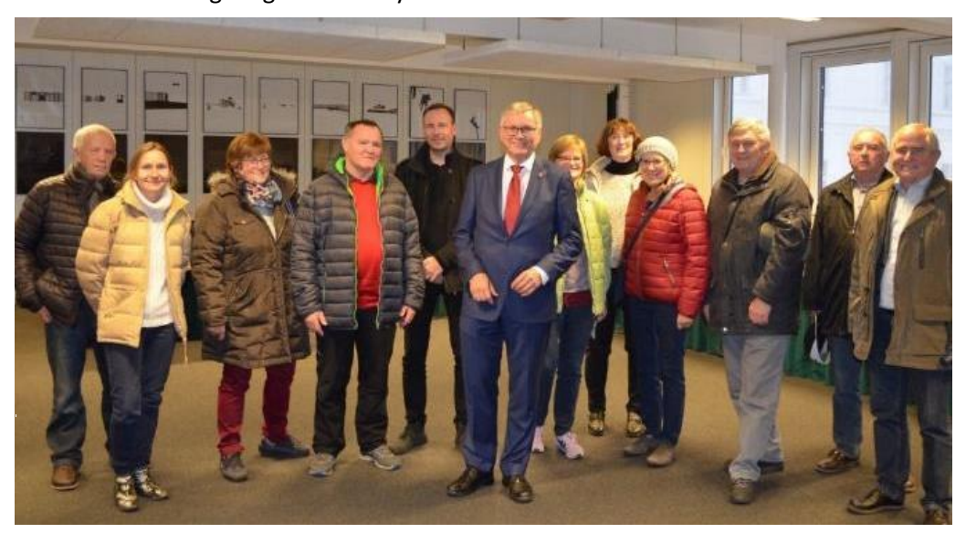
Group travelling to the European parliament with the school.

Before the pandemic, digital services were an impossibility, there was a great push for modernization, but our motto is "go digital and stay social".