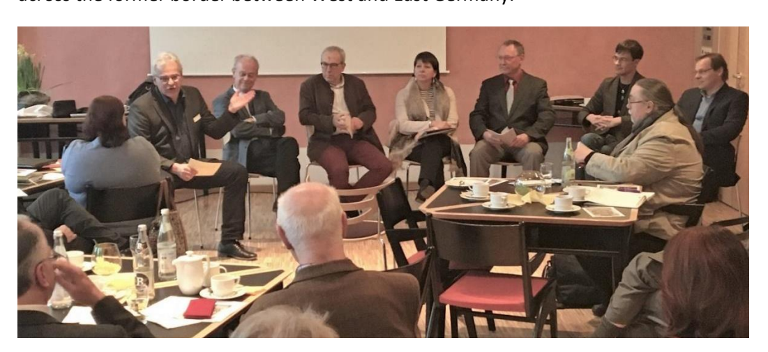
Bringing together local politicians at Evangelisches Bildungs- und Tagungszentrum Bad Alexandersbad.

We are active in combating racism and extremism through our participation in programs such as the Bavarian Alliance for Tolerance and Living Democracy and support local initiatives in the region and across the former border between West and East Germany.