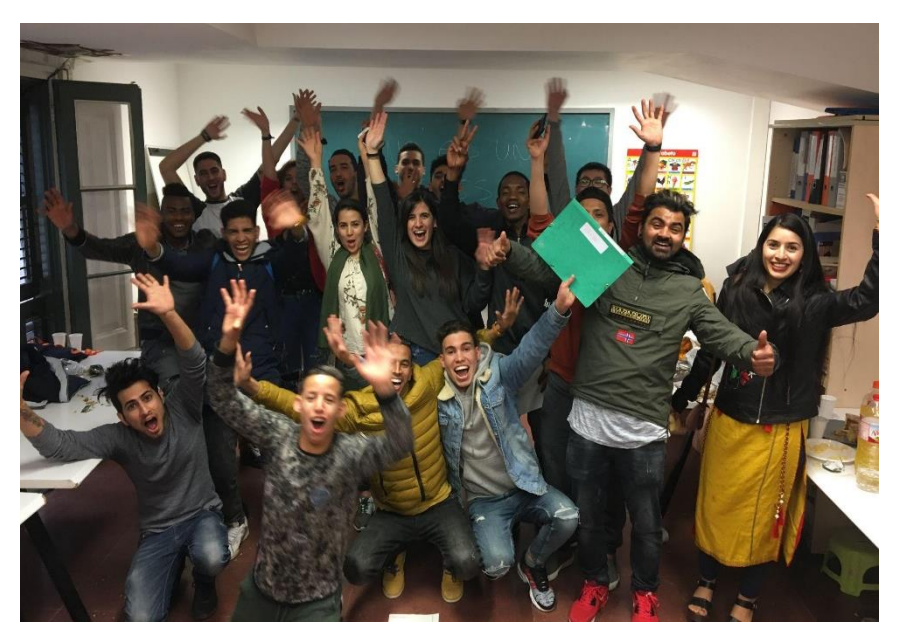
Participants at EICASCANTIC.

In our educational work with the migrants in our neighbourhood we focus on their rights as migrants and as citizens. They learn about our neighbourhood and the whole city and how they can participate in different contexts. In this work it is necessary to have an intercultural approach recognizing the values of participants' cultures of origin.