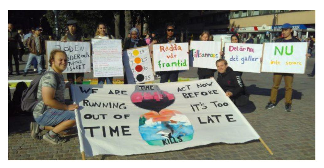
Students from the school in a demonstration for climate action in Gävle.

The didactical strategies we use are different in different courses but may involve giving big responsibility to our students for day-to-day management and codesign of the courses; involving them in producing a blog, a pod radio show, movies or magazines; organizing meetings, seminars/webinars, conferences; organizing demonstrations and campaigns; collection of lists of signatures; setting up new organizations; setting up new projects and linking people to existing campaigns, organizations etc.