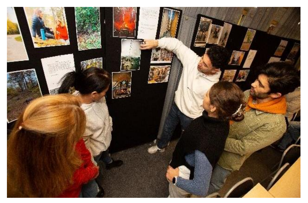
Participants present results from a local investigation at Red Cross Folk High School.

Another line of action is trying to establish contacts with organizations, networks, and authorities in Skärholmen.