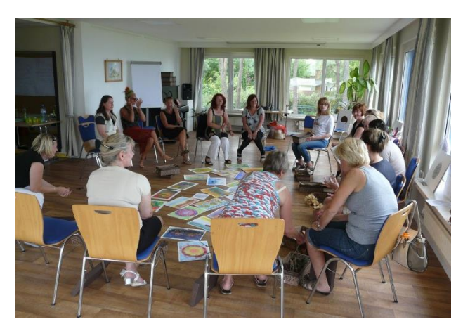
Participants in the school.

We carry out activities for the development and creative activities of senior citizens, activation, and social development, intergenerational integration, as well as the transmission of values and positive social patterns.