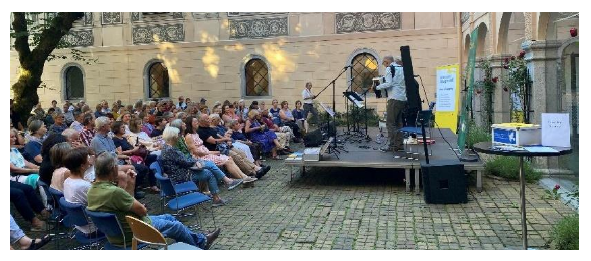
Ukrainian musicians in the yard of Schloss Puchberg.

We are active in many different networks working on democracy and human rights. This gives us visibility, acceptance, partnerships, and access to information. Based on this, we renew our offers based on the suggestions that come from our various contacts. For example, we are now developing activities on organic farming and new techniques for soil improvement, following suggestions from two farmers with this focus. Another example is that we participate in local events to commemorate the victims of Nazism.