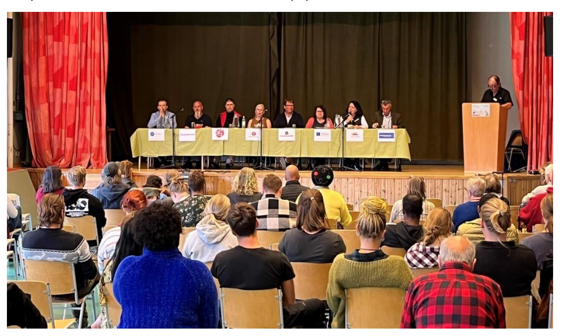
Political debate at Bäckedals folkhögskola.

Participants will learn how to appeal against government decisions and how to write citizens' petitions. They will also learn how to write letters to newspapers.