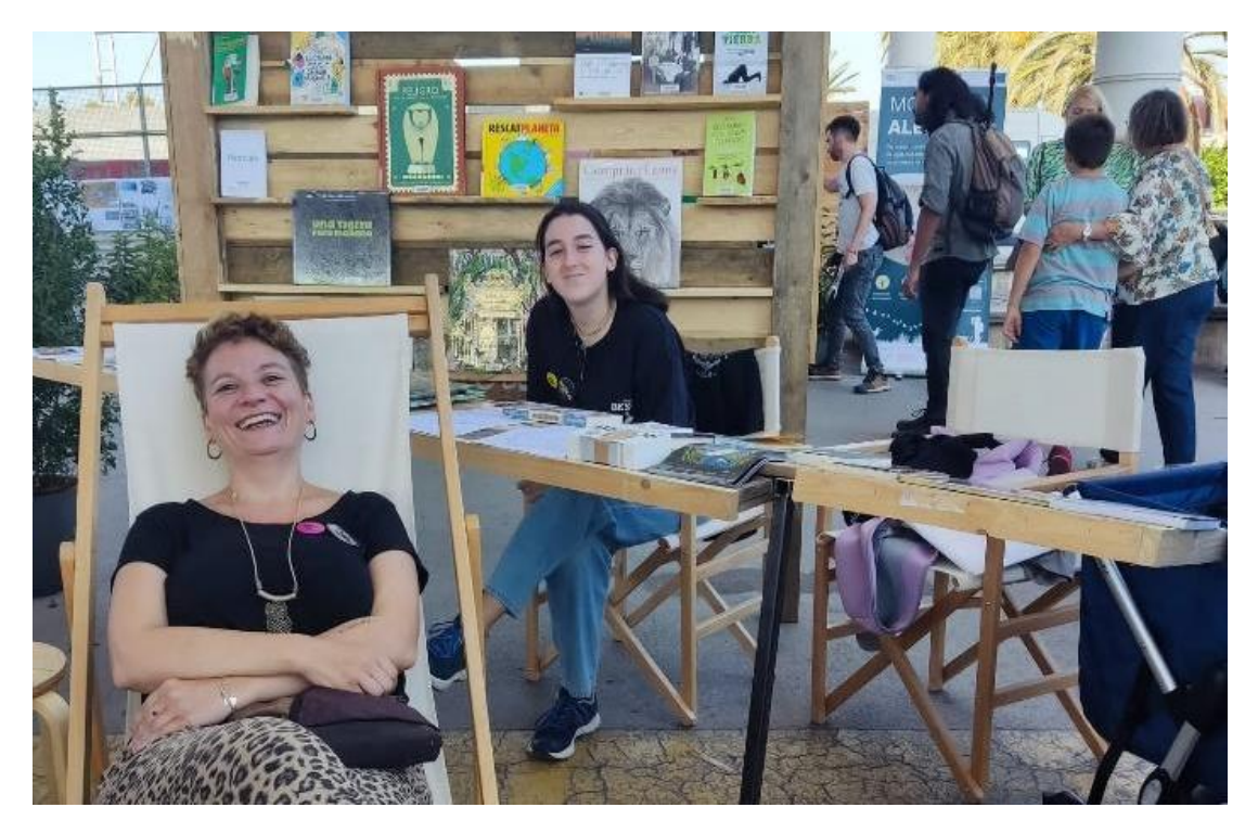
The library Is active together with the inhabitants of the districts.

Being present in the area is crucial. Bonding and community work are our keywords. We need to be present on the streets and at different meetings to understand the needs and to support important initiatives. We also use WhatsApp a lot to keep in touch with the associations in the area.