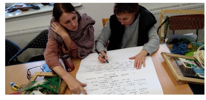
Students of a two-year course of arts and crafts working on a social project.

Beyond this, education at the school is about creating a community based on the principles of partnership, democracy, relationship building and shared responsibility for where and when we meet. We create a microcommunity where we 'train' civic activities.