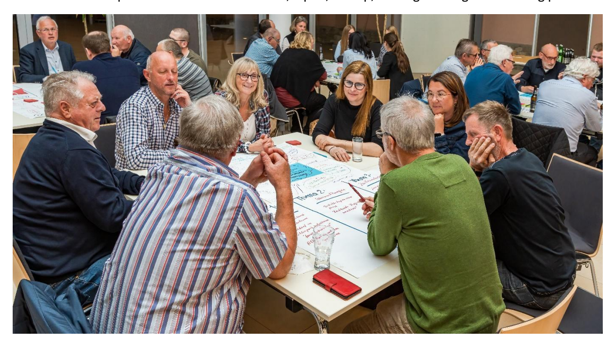
Group working together at SPES Zukunftsakademie.

A concrete example is the Nah Da project where SPES works with local development groups and through civic engagement creates local development centers to meet identified social and economic needs. This can be done through the formation of cooperatives such as in St Stephen's Afiesl where citizens in the cooperative form now run a cafe, a pub, a shop, and a gathering and meeting place.